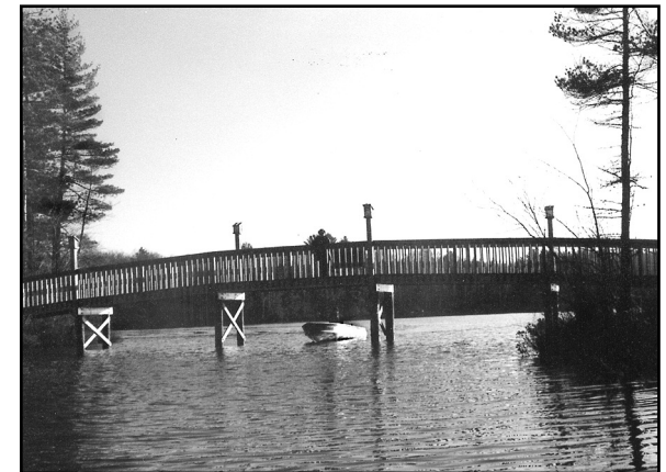
Footbridge to Nature Point

A Naturally Designed, Environmentally Concerned Timeshare Resort With 1100' Frontage On A Chain Of 28 Lakes